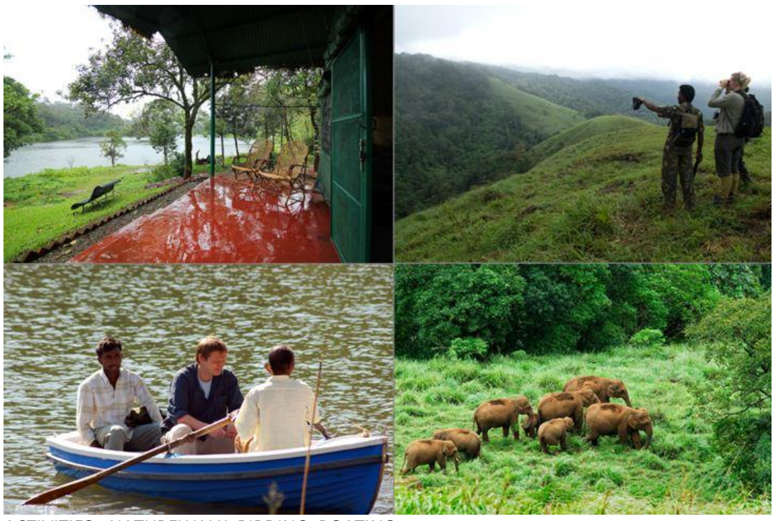
ACTIVITIES - NATUREWALK, BIRDING, BOATING ALL MEALS SERVED OVERNIGHT STAY AT GAVI

BREAKFAST SERVED CHECK OUT BY 9AM AND PROCEED TO GAVI – 5.5 HRS DRIVE CHECK IN FEATURED PROPERTY