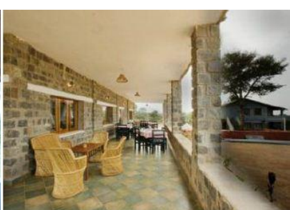
LEISURE AT THE PROPERTY OVERNIGHT STAY AT MASINAGUDI