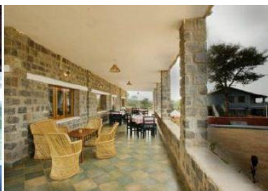
OVERNIGHT STAY AT MASINAGUDI