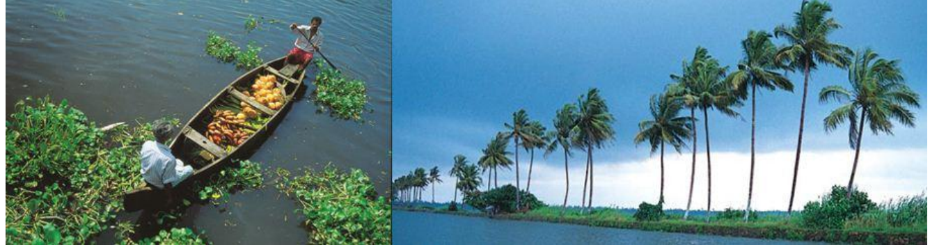
Alleppey is one of the most important tourist centers in the state, with a large network of inland canals earning it the sobriquet "Venice of the East". These large networks of canals with spectacular Backwaters, Beaches, Marine products & Coir industry provide Alleppey its lifeline.

A glide in a "Kettuvallam" (a traditionally decorated Houseboat) through the enchanting backwaters of Alleppey is sure to rob your heart. Palm fringed narrow canals winding through the vast expanse of paddy fields and the neat tiny hamlets lined up along either side of the canals are panoramic pictures reflecting the charm of this unique land.