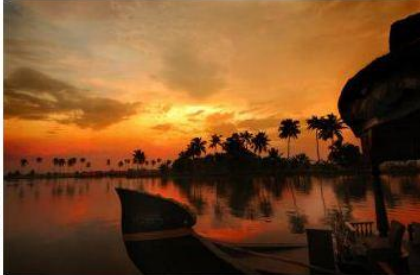
CRUISE BEGINS AT 12 NOON CRISE THROUGH VEMBANAD LAKE ALL MEALS SERVED OVERNIGHT STAY IN THE HOUSE BOAT